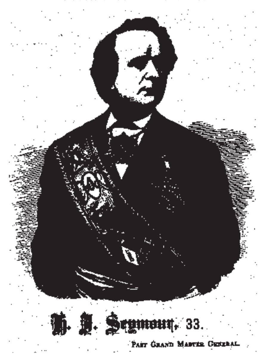
Figure 2. Harry J. Seymour, 96–33°, Past Grand Master General of the Rite of Memphis, was expelled from the Supreme Council, 33°, N.M.J. in 1865 for "gross un-Masonic conduct." From The Constitution and General Statutes for the Government of the Ancient and Primitive Rite of Freemasonry.... (New York: Excelsior Printing Co., 1874).