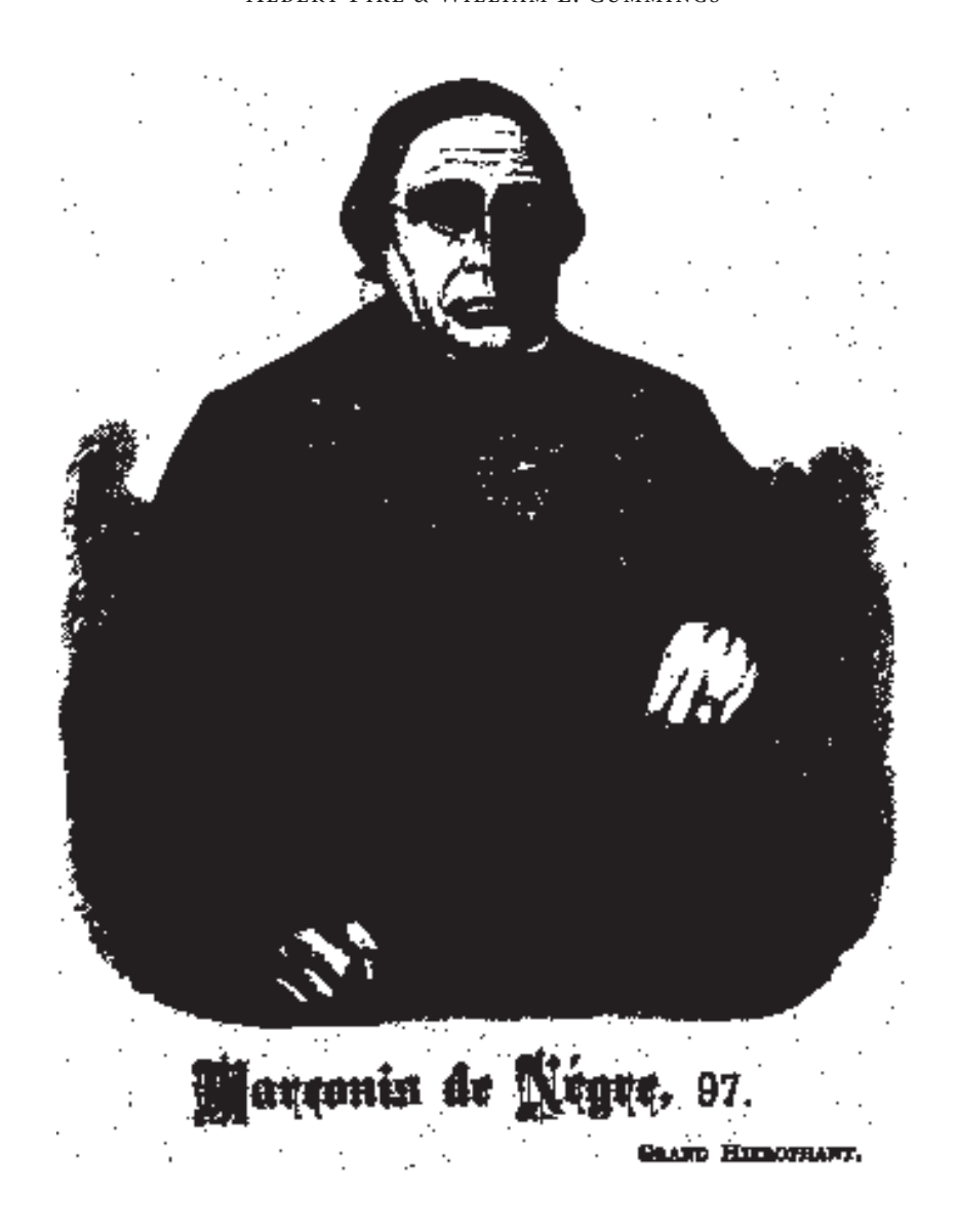
Figure 1. Jacques Etienne Marconis de Négre, 97°, Grand Hierophant of the Rite of Memphis. From The Constitution and General Statutes for the Government of the Ancient and Primitive Rite of Freemasonry.... (New York: Excelsior Printing Co., 1874).